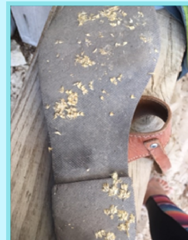
Seeds encountered during biosecurity checks prior to departure to Aldabra (above); biosecurity checks for tourists visiting Aldabra (above right); supplies bound for Aldabra being thoroughly checked (right)

Invasive ant eradication on islands is estimated at USD 19,000/ha (→ Aldabra 15,500 ha = USD 293m) Early detection pays off