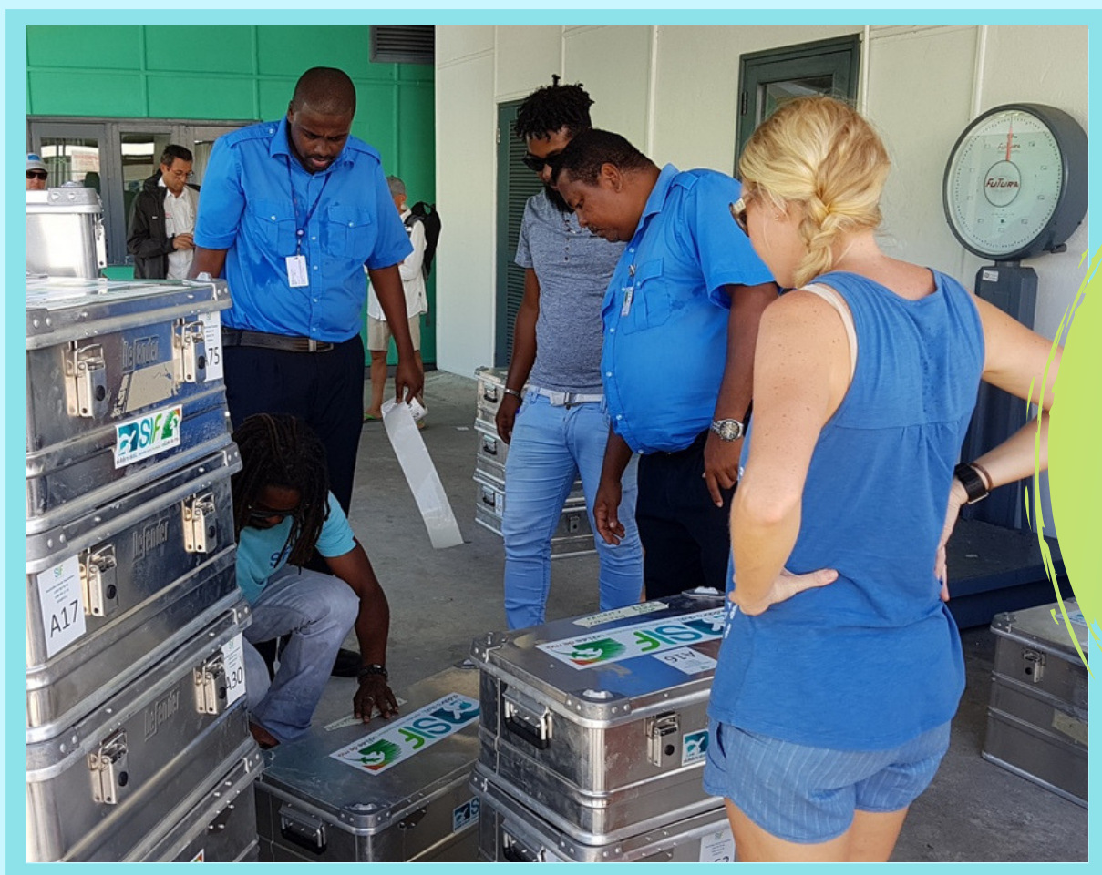
Sending supplies in pest-proof containers to Aldabra after thorough inspection of all items

Invasive ant eradication on islands is estimated at USD 19,000/ha (→ Aldabra 15,500 ha = USD 293m) Early detection pays off