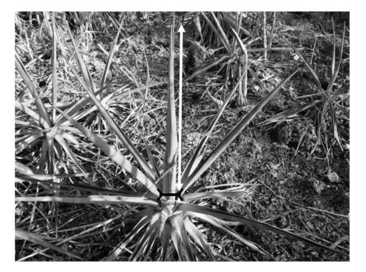
Figure 2. Sisal plant showing central growth stem (white vertical line) and location of cut (black horizontal line) for herbicide application.

Aldabra showed that leaves tended to be folded inward during dry periods, limiting access for herbicide application to the leaf surface. Our trial was therefore carried out after the first rains at the end of the dry season (June–October), with treatment conducted during 17–19 November 2013 in dry conditions.