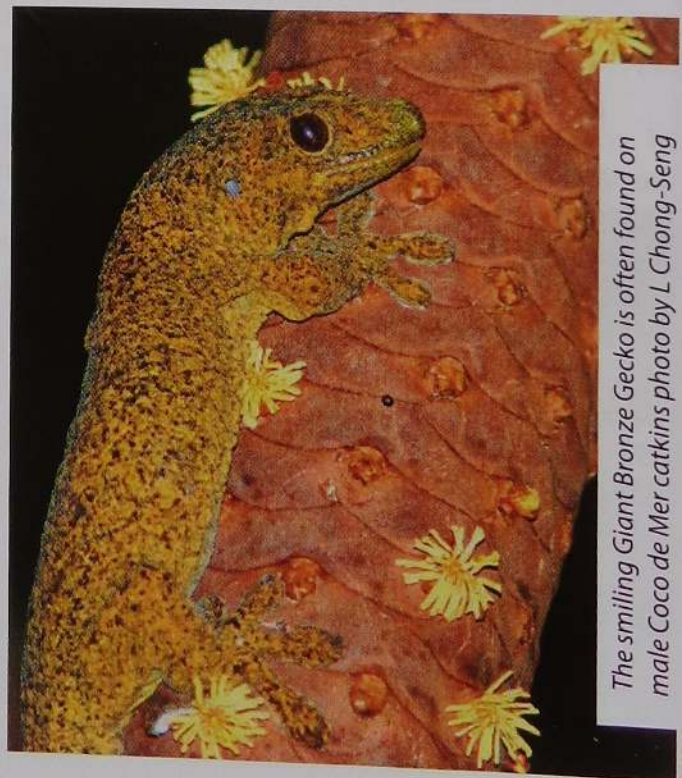
The smiling Giant Bronze Gecko is often found on male Coco de Mer catkins

After purchasing your ticket the journey begins! When you arrive at the gate to this ancient forest take a minute to examine the Coco de Mer nuts and catkins at the shelter. Feel how heavy the Coco de Mer nut is, the largest seed