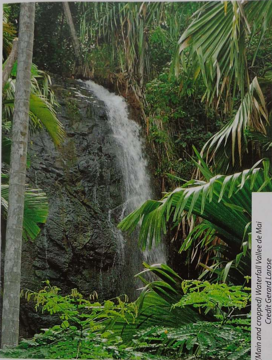
(Main and cropped) Waterfall Vallée de Mai

A UNESCO World Heritage Site with a difference