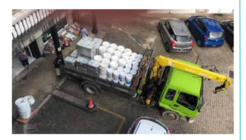
Supplies leaving Head Office after biosecurity checks

SIF partnered with La Digue Glory barge in October to transport much-needed supplies and equipment to the Aldabra and make sure our strict biosecurity standards are met. After some very intense weeks of purchasing, doing biosecurity checks and repacking supplies with great team spirit, all efforts finally paid off during the final loading days of the supply boat. After six months without supplies, and a busy north-west season coming up, it was one SIF's biggest cargo supplies to Aldabra and a massive operation. Two shipping containers, 36 fuel drums, construction materials, the renovated Aldabra boat Manta and much-needed new food supplies finally sailed off to Aldabra.