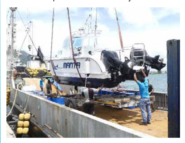
Aldabra's renovated boat Manta being loaded onto the supply boat

we discovered a yellow crazy ant queen in front of the loading ramp on Mahé, which reinforced for the whole team how real the threat of invasive species is and how important their biosecurity work is.