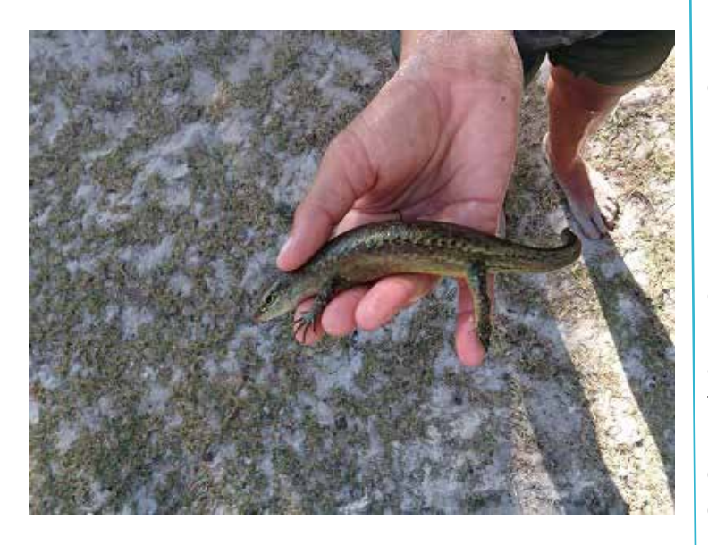
Wright's skink intercepted at Aldabra