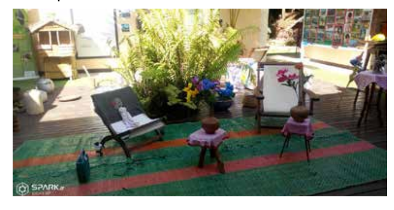
A display of a traditional Creole house at the Vallée de Mai

The deck of the Vallée de Mai visitor centre was transformed into a typical traditional Creole house. Antique household items were on display on the deck. Visitors were mostly interested to learn about the functions of some of the antiques. The guides had the chance to demonstrate how some of the items were used in the past.