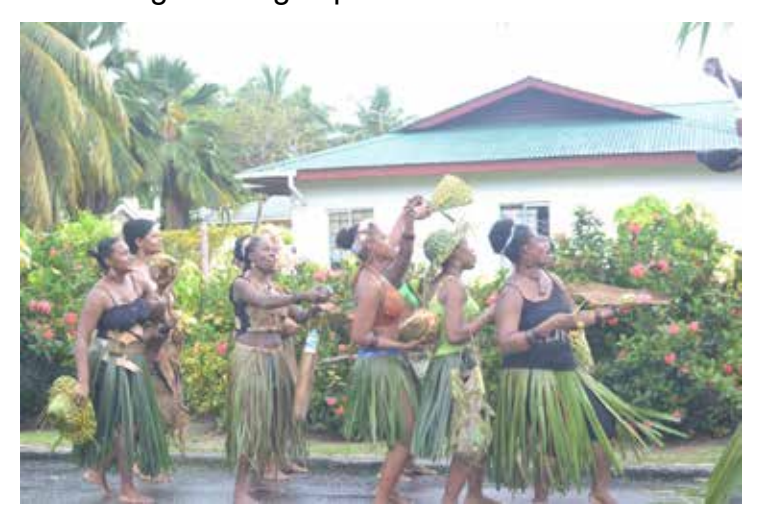
The Vallée de Mai team dancing at the Laserenad

very surprised by some of the practices that had taken place in the past, particularly in cases where they saw inequality between males and females. Lively and frank discussions came from both groups, and everyone found it an interesting learning experience.