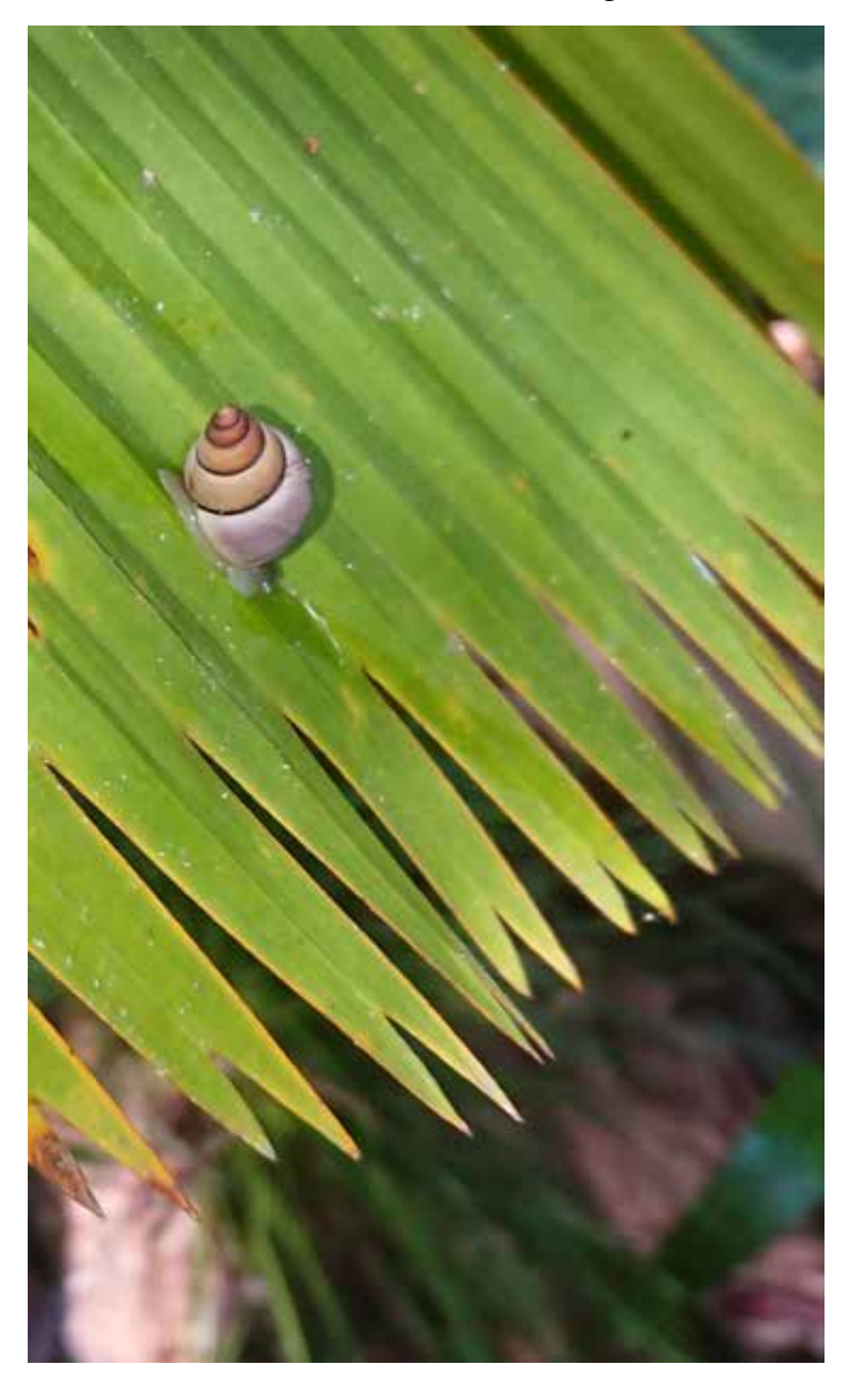
Praslin snail at the Vallée de Mai

bodied and slow moving. Finally, skinks and crabs are monitored as they are predominantly ground-based, and may be threatened by high densities of YCA but are also at risk of consuming the ant bait.