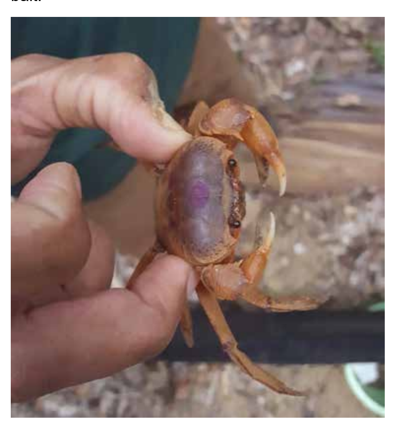
Freshwater crab at the Vallée de Mai

specifically designed surveys. Firstly, levels of activity and abundance of YCA are monitored throughout the forest by using a jam lure (they love sugar!). Ant communities are monitored to assess how they may be impacted by YCA presence and abundance. Geckos and molluscs are monitored due to their vulnerability to YCA attacks, particularly molluscs, being soft bodied and slow moving. Finally, skinks and crabs are monitored as they are predominantly ground-based, and may be threatened by high densities of YCA but are also at risk of consuming the ant bait.