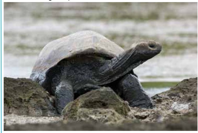
Giant tortoise in mud at Aldabra

However, Odense Zoo's generous donation of 6000 euros has enabled SIF to embark on a pit-tagging project for the giant tortoises, which is a vast improvement on the previous tracking method and will allow us to track tortoises on Grande Terre and those individuals that have smaller, thinner shells which cannot be branded. A PIT tag is a small radio transponder that contains a unique code, which allows individual tortoises to be assigned a unique 10 or 15-digit alphanumeric identification number.