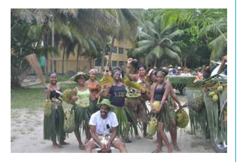
The Vallée de Mai team at the Laserenad

Seychelles' Creole Festival is a famous celebration and regarded as one of the most important annual events in the country. The festival takes place each year to bring Seychellois together, revive Creole traditions and cultures whilst also embracing the opportunities of the present.