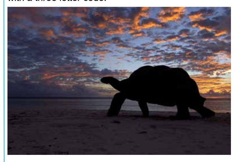
Giant tortoise at sunset on Aldabra

and reproductive ecology. The programme is a continuation and expansion of monitoring that has been ongoing at the atoll since the 1990s. For the first 15 years the monitoring programme counted but did not mark tortoises, and there were enormous benefits in data quality and information once we started to mark individual animals. We've now marked most tortoises on Picard by branding their scutes or shells with a three letter code.