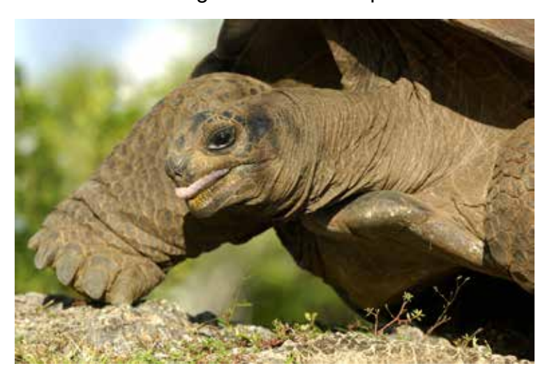
Giant tortoise on Aldabra

In October SIF was delighted to receive an extremely generous donation from Odense Zoo in Denmark towards its giant tortoise monitoring programme on Aldabra. Odense Zoo have Aldabra giant tortoises in their collection and they are keen to support the work of SIF in monitoring this wonderful species.