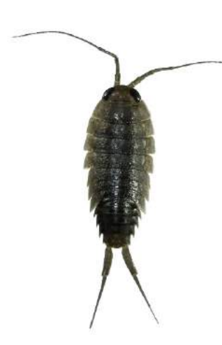
Ligia isopod

A new paper has been published on the Ligia isopods of Seychelles, with samples from Aldabra included in the analysis. Ligia isopods, known as rock lice or sea slaters, usually live in rocky intertidal habitats, although they can survive on both sea and land for a short time if necessary. biological Their traits mean that their ability to