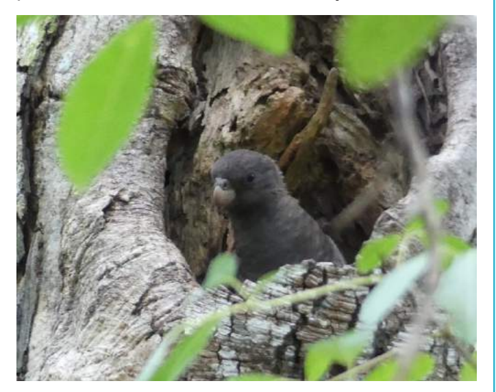
Seychelles black parrot

The breeding season of the Seychelles back parrot has started once again, and the Vallée de Mai research team is very excited to be starting their annual breeding season monitoring of the parrots for the ninth consecutive year.