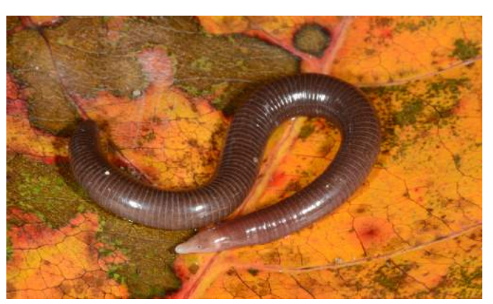
Petite Praslin caecilian (Hypogeophis pti)

New research published in the journal Zootaxa has revealed a newly discovered caecilian, taking the number of described caecilian species in Seychelles from six to seven! The newly described species is called Hypogeophis pti (petite Praslin caecilian) and is thus far known only from a small area approximately in the centre of the island (including in habitat adjacent to the Vallée de Mai). It has been given the scientific name Hypogeophis pti , with the species name ( pti ) given in reference to the Seychellois Creole spelling of the French petit(e) for small.