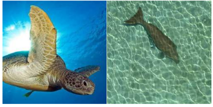
A green turtle and a dugong

The convention is an international treaty which was signed in 1979 and entered into force in 1983; it now has over 120 member states and is recognised as one of the most important international conservation agreements.