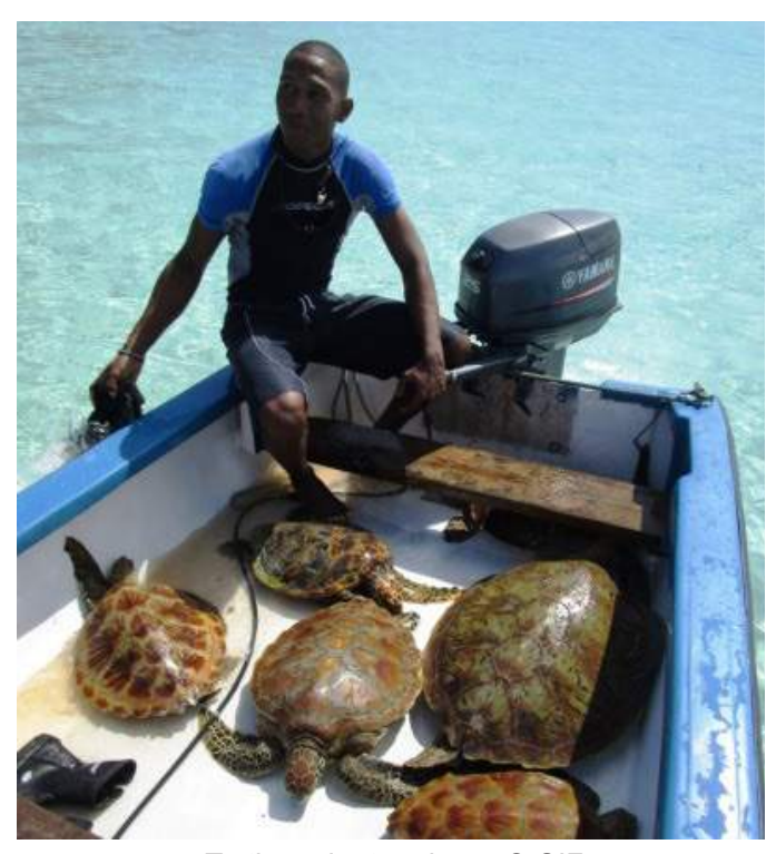
Turtles prior to release

house analysis of data from 20 years of in-water monitoring of juvenile turtles in the Aldabra lagoon revealed some interesting trends and information.