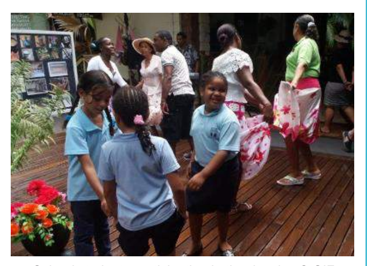
School students participating in the dancing

Each year SIF organises activities at the Vallée de Mai to celebrate the Creole festival. The Creole festival is one of the most important events on the calendar of activities for SIF as it gives visitors the opportunity to experience Creole culture and taste the local food and drinks that they may not otherwise experience. This year Creole festival activities took place from the 23rd to 30th October. These activities included traditional dance and song performances, sales of local snacks and drinks, exhibition of antique items, traditional games and a photo exhibition.