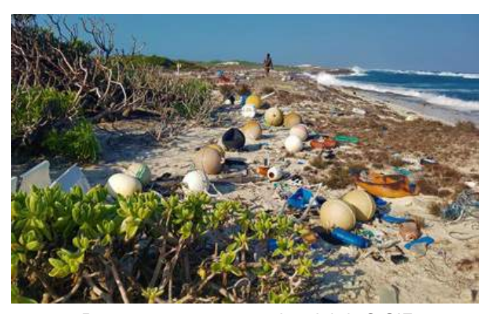
Buoys are common marine debris

Marine debris is a global environmental problem affecting us all. Even the most remote and pristine areas on the planet such as Aldabra