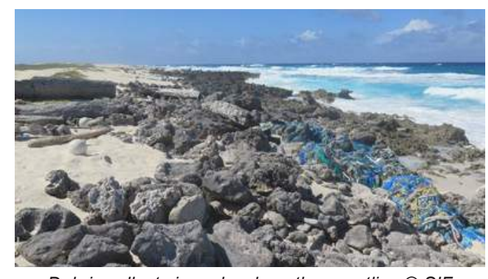
Debris collects in rocks along the coastline

In the meantime, you can join us in making a change! Each of us can do our part by reducing the amount of plastic we use, avoiding single use plastic bags and products with excessive packaging, undertaking local beach clean-ups or raising awareness on the issue within our community. With so much trash and litter entering our ocean every year, the task of preventing and reducing marine debris is an urgent challenge that we must all meet to preserve the health of our planet.