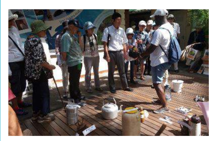
Traditional household items on display

band, visitors gathered to observe and take photos, and the more courageous of them joined in! During the week visitors could also watch performances of another popular traditional song, the kanmtole, performed by Vallée de Mai staff.