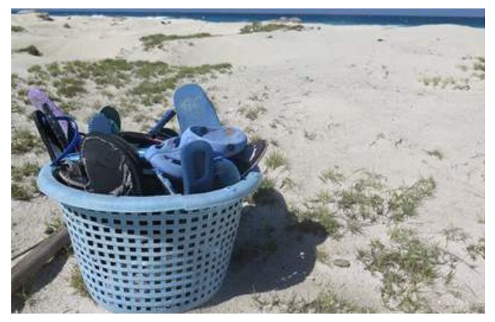
Flip flops are another common marine debris item

Marine debris consists of a variety of items, such as discarded water bottles, plastic items, polystyrene, wood or abandoned fishing nets,