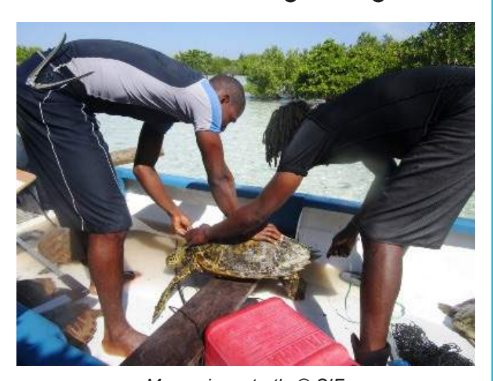
Measuring a turtle

The Aldabra lagoon has long been recognised as an important developmental and foraging habitat for large numbers of juvenile and immature green and hawksbill turtles and the team on Aldabra has been regularly monitoring these turtles since 1996. This type of monitoring is known as 'turtle rodeo' owing to the technique used to capture swimming turtles, staff are required to leap out of moving boats. Captured turtles are tagged on both flippers, measured, weighed and released. A recent in-