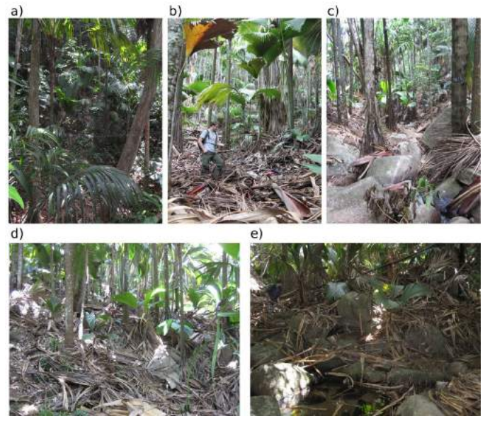
Habitat in which type specimens of Hypogeophis pti sp. nov. were found between 2014 and 2015 on Praslin. (a) Glacis Noir, (b–e) Fond Peper

Boulenger, 1911. Zootaxa. 4329. 301 - 326. 10.11646/zootaxa.4329.4.1.