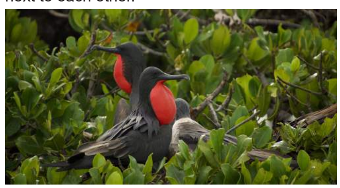
Frigatebirds with distinctive gular sacs on display

The two species show different breeding patterns and timings. In general there are more lesser frigatebirds on Aldabra than greater frigatebirds. In some colonies only one species of frigatebird occurs, and in other colonies both species nest next to each other.