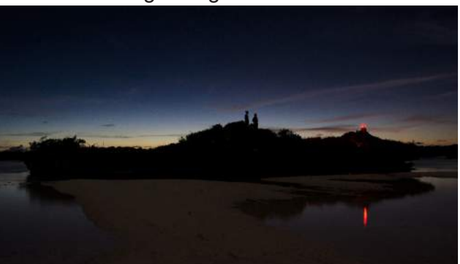
Shearwater researchers in the lagoon at night

The six-week expedition was very successful. Over 30 tropicbird feeding trips were recorded with GPS loggers, and the initial data show very interesting patterns. For example, both red-tailed and white-tailed tropicbirds feed very far from Aldabra, with all birds flying several hundred kilometres away. Some of the cameras are still on Aldabra collecting data, but preliminary results suggest that heavy rain, rats and herons are responsible for some nest failures, rather than there being a single cause.