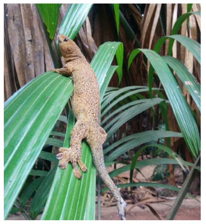
A giant bronze gecko shows off its huge feet

a large body! Such big eyes! And then it flicked its tongue out of its mouth to clean its face... What a big tongue!" Emmanuel Morel, Vallée de Mai field research assistant commented that the giant bronze gecko "looks like a mini dinosaur, its gigantic! Just look at the size of its feet from a distance, absolutely incredible!" The team is now surveying in Fond Pepper followed by Fond Ferdinand to compare sites.