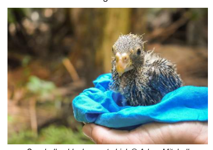
Seychelles black parrot chick

At the Vallée de Mai, the black parrot breeding season is entering its final weeks. The team have stopped discovering new eggs in nests and the early-hatching black parrot chicks have reached a good size, some them have started to fledge! In February there were a total of seven fledglings from the monitored nests. There are now 11 nests remaining in the monitored area.