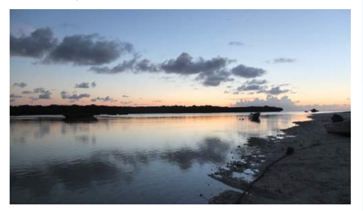
Sunrise over the lagoon as the team heads out

February 2019 saw the completion of the 9th annual frigatebird census on Aldabra. It took seven people, 76 man hours and three boats to survey the four frigatebird breeding colonies around the atoll. The colonies are all accessed from the lagoon and the team were often up at the crack of dawn to make full use of the high tides. The yearly census aims to monitor the number of breeding frigatebirds on Aldabra. In 2019, 6791 nests were counted in total, compared to 7713 last year and 4453 in 2017. The long-term results indicate that the frigatebird population is stable but we see considerable fluctuations in numbers from year to year.