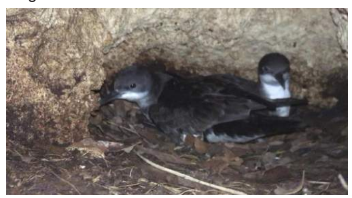
A pair of tropical shearwaters in their burrow

Annette also tagged 18 tropical shearwaters with tiny (1g) loggers called geolocators which will record the birds' location and activity for up to 2 years. Tropical shearwaters are poorly known, elusive seabirds, which only come to land after dark. The tracking data will help us find out more about their breeding patterns and long-distance movements at sea.