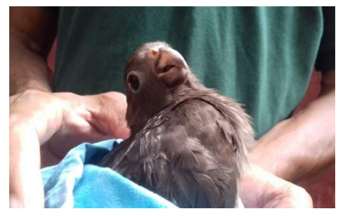
The injured chick being well looked after

Some bad news turned into a highlight of the month for the Vallée de Mai team. An injured black parrot chick was picked up by the Seychelles National Parks Authority (SNPA) staff at Glacis Noir, near the Vallée de Mai. The chick was brought to SIF staff and later ringed to be released near its nest, when it was discovered to have a small but serious wound at the base of