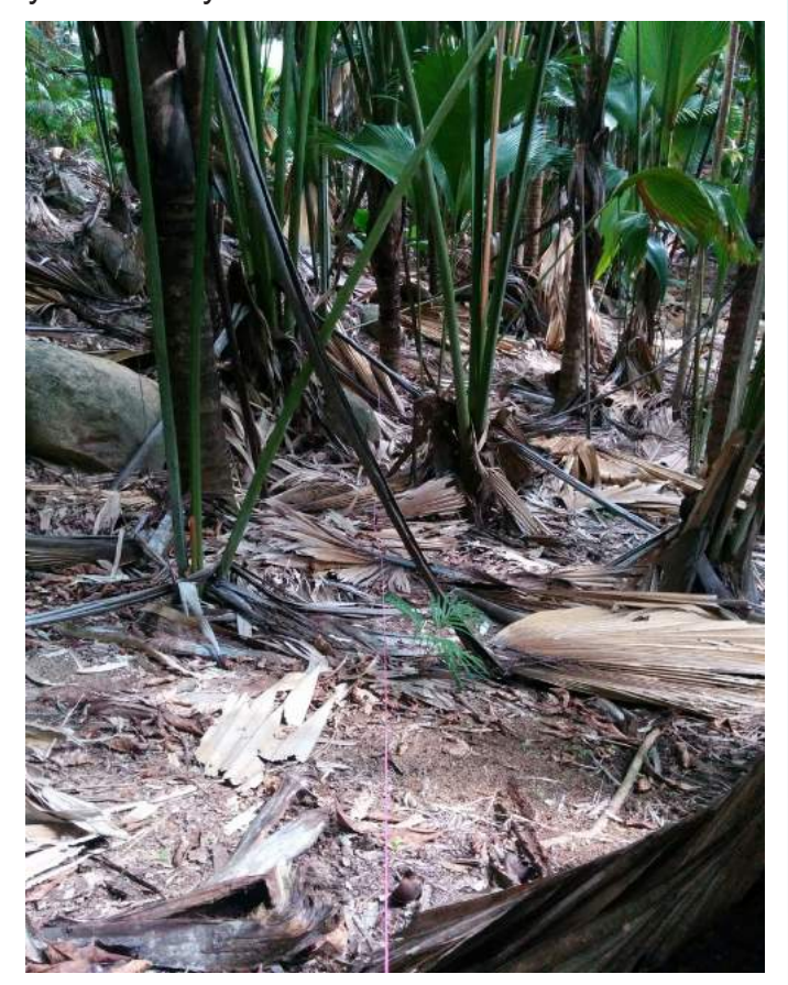
The team set up transects in the palm forest

After a short, incredibly sweaty and sometimes rainy month the Vallée de Mai team have completed a full herpetofauna (reptiles and amphibians) survey of the Vallée de Mai! An understudied group with a high proportion of endemic species, herpetofauna are also some of the most threatened species, particularly in light of invasive alien species threats, such as yellow crazy ants