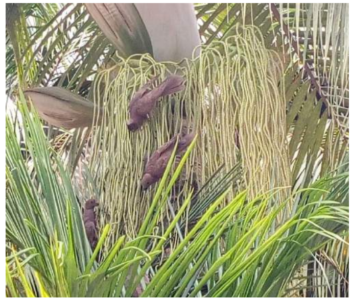
Black parrots feeding in a palmiste next to the visitor centre

size. This involved a lot of tree climbing and ladder setups, a very intensive and physically demanding process. The team also spent long hours in the field observing parrots and trying to identify the parents of the chicks from the different nests, something that requires a lot of patience. Some nests are very high and need a whole team of four to facilitate access. By the end of February a total of 14 chicks had been ringed.