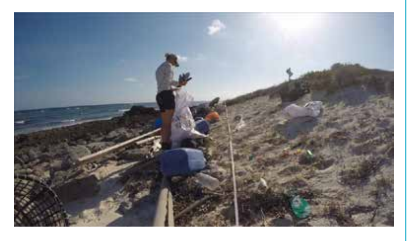
April collecting plastic waste on Aldabra

The healthier reefs are, the faster they can recover, and some reefs have a higher resistance to bleaching and temperature stress. Places like Aldabra may act as nurseries and produce larvae which repopulates coral in other areas. Aldabra's coral has responded differently to bleaching events between lagoon reefs and outer fringing reefs - April will investigate these differences at a genetic level. She has been collecting coral samples from a number of sites across Seychelles with the help of organisations such as Seychelles National Parks Authority, Global Vision International and Island Conservation Society.