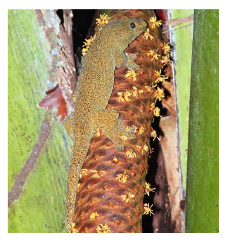
Giant bronze gecko