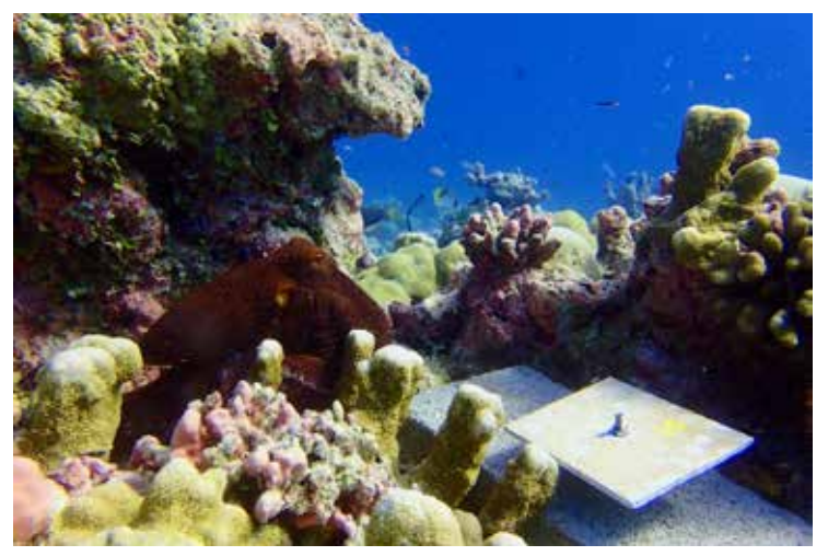
Terracotta tile on coral reef

Alongside the reef monitoring, Anna and the SIF Aldabra team have been studying coral reproduction by leaving terracotta tiles on the reefs. Two months later they count the number of little corals that have settled as larvae on the underside of the tiles. The last tiles will be taken out this August, but they have already encountered high numbers of up to 120 baby corals per tile!