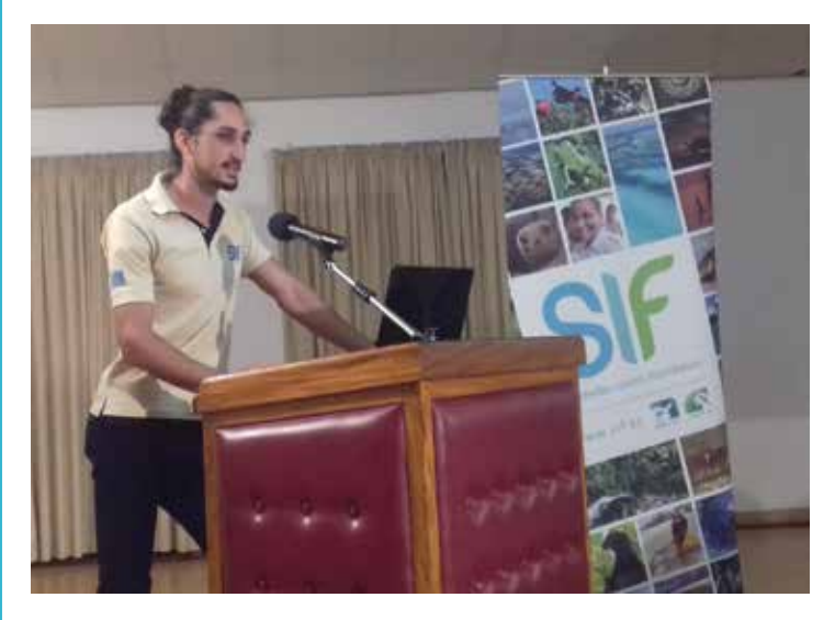
Emmanuel presenting at the symposium

gradually spread all over Mahé and were first recorded on Praslin in 1975. After being detected in the Vallée de Mai in 2009, SIF has been monitoring the increase and spread of the invasive ants. They showed a slow spread at first which accelerated after 2015 to reach full coverage of the Vallée de Mai by 2018.