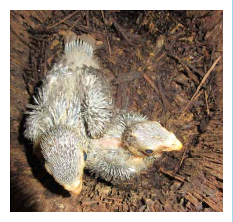
Two black parrot chicks

work is needed to determine the impacts of rats and other factors on black parrot breeding success.