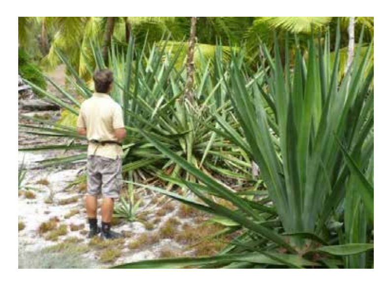
Invasive plant sisal

Sisal was first recorded on Aldabra in 1956, and there have been numerous attempts to remove it ever since. SIF manually cleared a sisal patch from the island of Malabar in 2005, but similar efforts were unsuccessful in Picard, Polymnie and lle Michel where the plant continued to reappear.