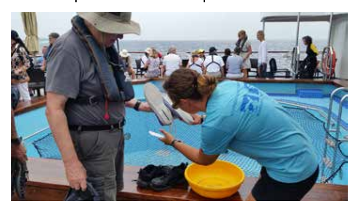
SIF staff carrying out biosecurity procedures

SIF's recent COI-funded biosecurity project ensured that international biosecurity measures and best practices were implemented to ensure