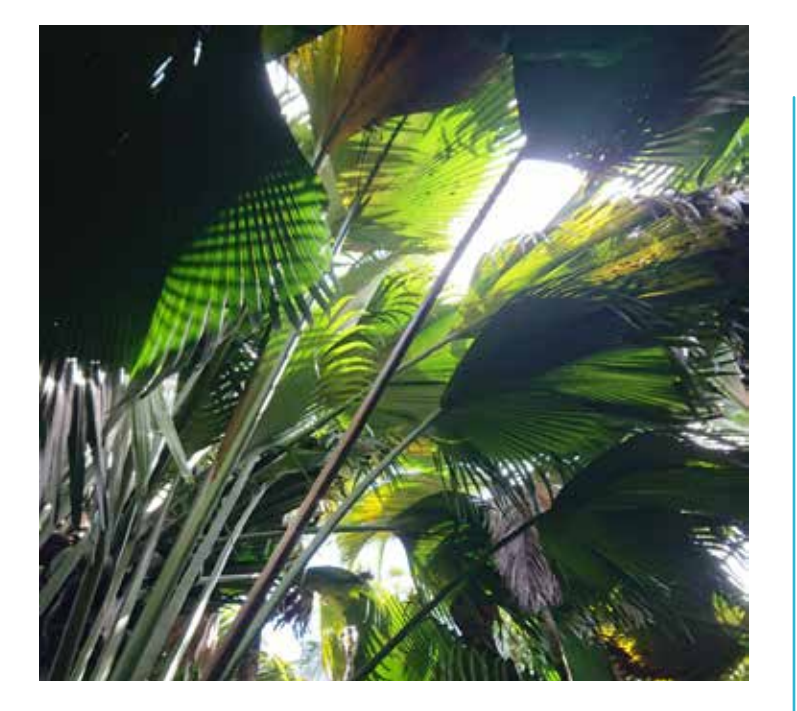
Coco de mer leaves

Katy has been looking at the data collected in the last 10 years to try and answer these research aims. Analysing the data can help us to understand how the plants are likely to respond to climate anomalies such as periods of drought or flooding. If we can discover links between the plants and the black parrot breeding season, then we can predict what might happen as our climate changes, and help conserve the unique ecosystem at the Vallée de Mai.