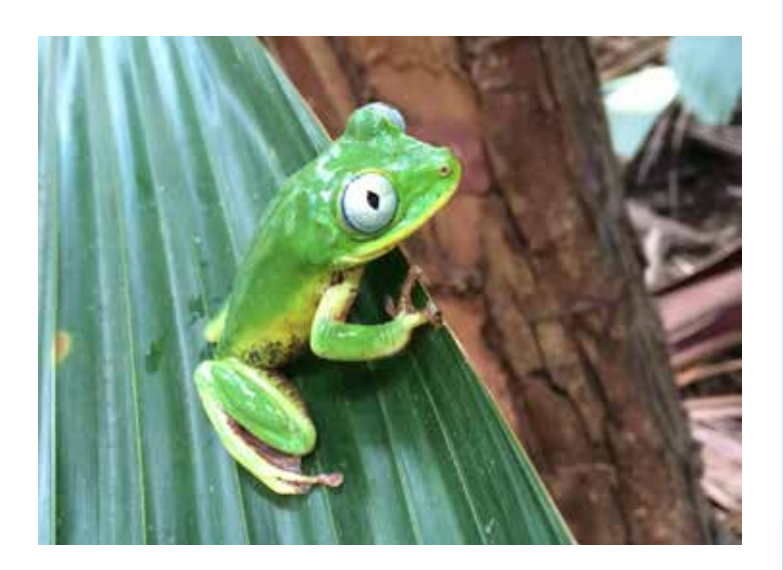
Seychelles tree frog

Louise is surveying the herpetofauna using a distance sampling method, in which researchers walk along transects (fixed pathways) twice a day, recording the animals they see along the way. This is a difficult task as they are hard to spot! The results therefore underestimate the true numbers but they provide comparable data to show trends over time. The dwarf bronze gecko was seen the most frequently, with over 60 sightings, which is enough to estimate the overall population numbers in the Vallée de Mai.