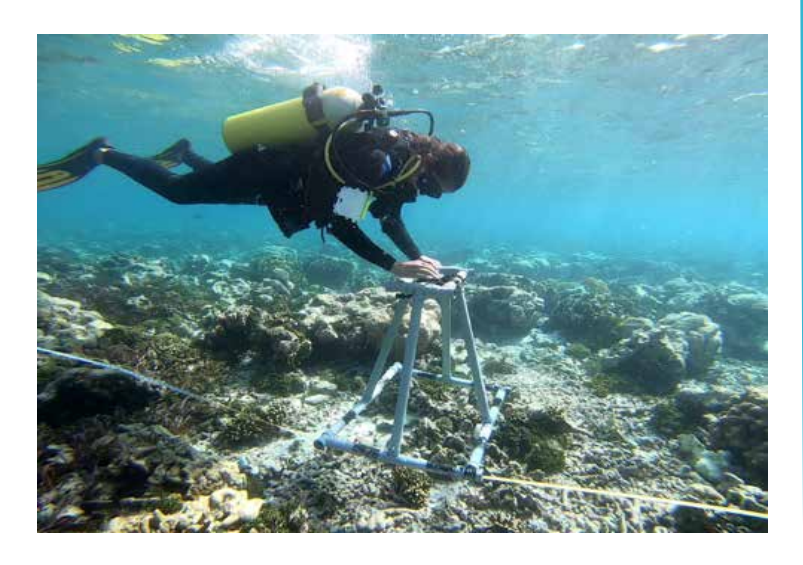
Aldabra reef monitoring

In 2013, SIF started the Aldabra reef monitoring programme to study the marine biodiversity and ecological processes in this unique and remote area. The reef monitoring takes place at several sites on the atoll and focuses on five main components of the reef system; water level and temperature, seafloor communities, fish communities, coral and marine predators. We use different methods to monitor the reef, including underwater dataloggers, taking photos of the reef, counting fish and new corals and filming videos of marine predators.