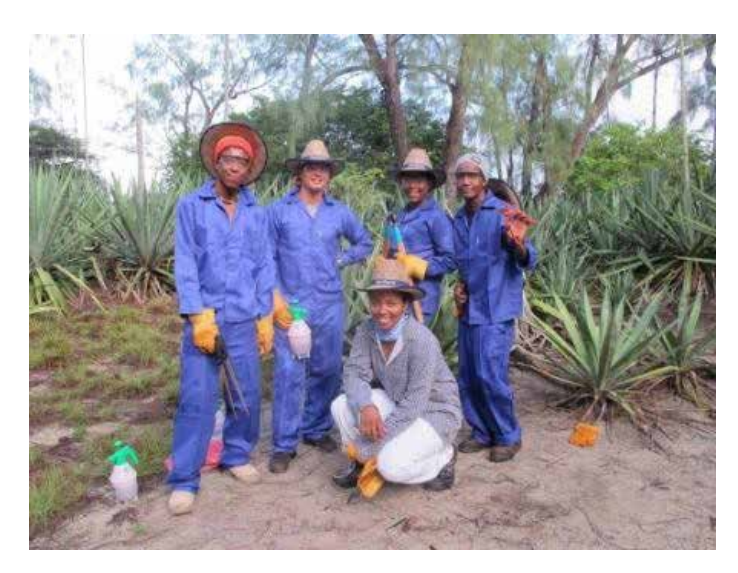
Sisal eradication team on Aldabra

Picard and Polymnie remained free of sisal, but the plant regrew on lle Michel after the wet season. SIF re-applied the treatment and continued monitoring. They needed lle Michel to be free of new sisal growth for over two years before it could be considered in the clear.