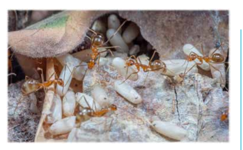
Yellow crazy ants