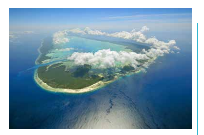
Aldabra Atoll

The healthier reefs are, the faster they can recover, and some reefs have a higher resistance to bleaching and temperature stress. Places like Aldabra may act as nurseries and produce larvae which repopulates coral in other areas. Aldabra's coral has responded differently to bleaching events between lagoon reefs and outer fringing reefs - April will investigate these differences at a genetic level. She has been collecting coral samples from a number of sites across Seychelles with the help of organisations such as Seychelles National Parks Authority, Global Vision International and Island Conservation Society.