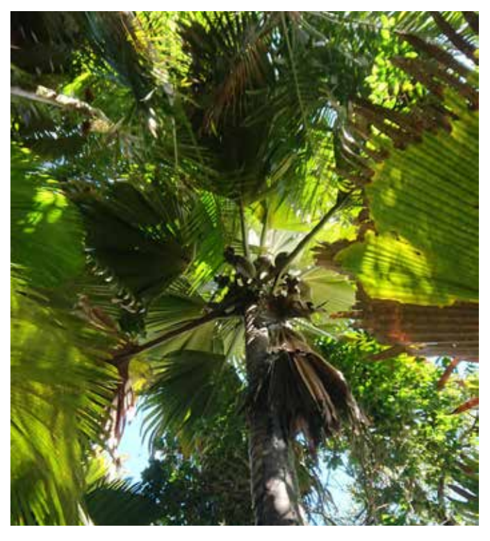
Coco de mer trees

The aim of this research is to determine when plants produce flowers and fruit, how these events respond to climatic factors such as rainfall, what links there are between fruiting events and the black parrot breeding season, and whether any plants need immediate conservation action.