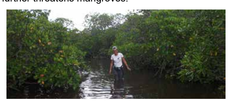
Annabelle in mangrove habitat on Aldabra

Mangroves are an important nutrient source for a whole host of species living in and around Aldabra Atoll including sharks, birds, mammals and invertebrates. Some mangroves assist with soil development by holding soil together, which in time allows for mature forests to develop on the atoll. This then creates a habitat for wildlife which can use the forest to shelter. Since the 1980s, 35% of the world's mangroves have been lost to development and conversion. In addition, sea level rise in the Indian Ocean has accelerated over the past decade, which further threatens mangroves.