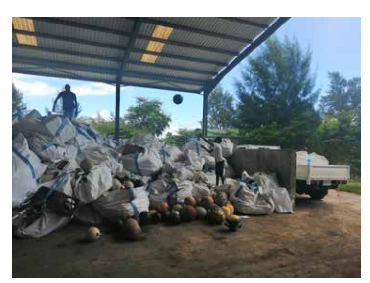
Reprocessing collected waste from Aldabra

The next step is reprocessing the collected waste, which is being stored by the Seychelles Government's Landscape and Waste Management Agency. Those who are interested in reusing, recycling or repurposing the plastic should contact SIF.