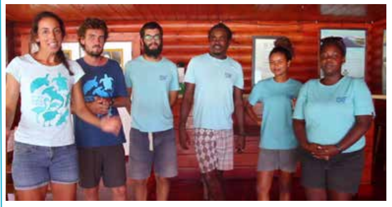
Aldabra research team

One of the most basic but important questions when monitoring a species is, how is the population doing? Are the numbers decreasing? Are they increasing? Is the population stable? Even though Aldabra is highly isolated, humans have still had a big impact on its ecosystem, mostly on the terrestrial side (such as introducing invasive species, harvesting and poaching).