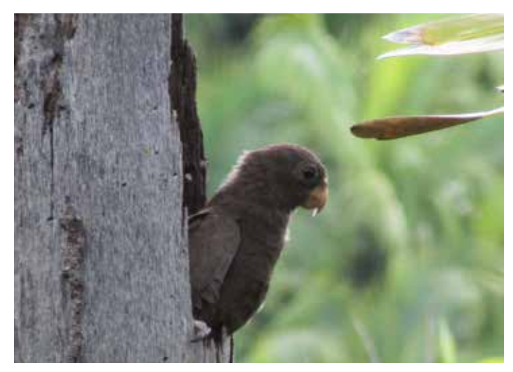
Black parrot in tree cavity

Black parrots seem to be quite picky about their nest holes but there does not appear to be a shortage of available cavities. However, nest failure rate is relatively high. In ten years, only 51% of nests have been successful and fledged at least one chick. And although there are many potential causes of failure (predation, yellow crazy ants, climate, food, disease), a main cause has not been possible to identify.