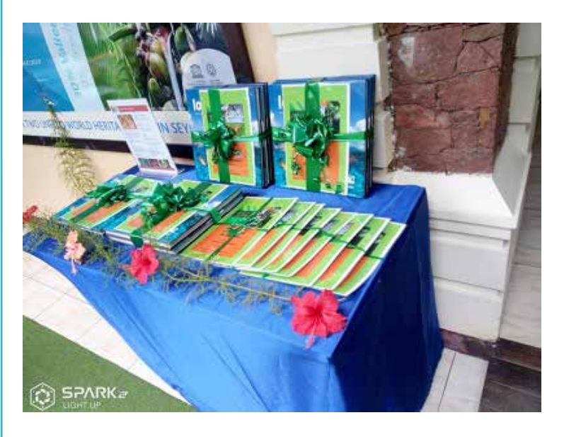
Prizes to be awarded to activity winners

Vallée de Mai. Once the partners understood the issue, they wanted to get directly involved in reducing YCA numbers in and around the Vallée de Mai using environmentally friendlly methods. We decided to channel this enthusiasm into a competition! Seven organisations took part in the challenge which was held on 6th and 7th June. Most of the teams used sugary baits to attract the ants, and some collected ants directly from their nests. This was a simple and very effective method used by Acajou which awarded them 3rd place in the competition.