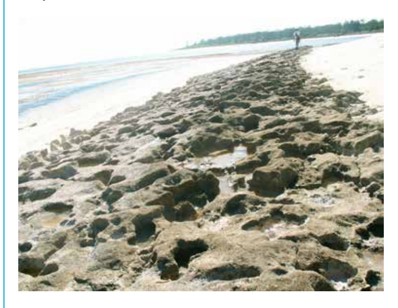
Researchers searching for skinks

skinks adapted to be able to exploit coastal habitats. This important new advantage also allowed the skinks to disperse widely, and they spread from Australia, west to the Western Indian Ocean islands and the East African coastline, and north and east to Hawaii and the Polynesian islands.