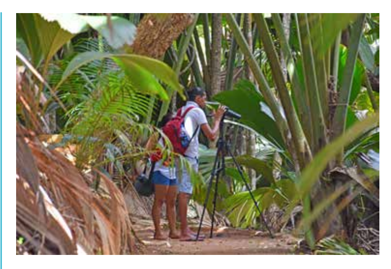
Film crew shooting footage in the Vallée de Mai

The film crew arrived at the Vallée de Mai on 20 June and our staff helped them to find the fascinating species that live in the forest. The crew saw seven giant bronze geckos, two of which were on a coco de mer tree. They also filmed the other two species of bronze gecko and both species of day gecko that occur in the forest, thus capturing all five endemic geckos of the Vallée de Mai. They were lucky enough to film several other endemics, including a juvenile Seychelles bulbul taking a bath in a stream, a coco de mer snail, and a Seychelles freshwater crab in a stream.