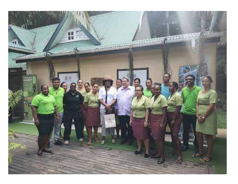
Dr Ralph Gonsalves with the Vallée de Mai staff

The Vallée de Mai celebrated Seychelles' National Day on Saturday 29th June with a visit from the Prime Minister of the Republic of Saint Vincent and The Grenadines, The Honourable Dr Ralph E. Gonsalves. National Day is an annual celebration to mark the anniversary of Seychelles' independence from the United Kingdom in 1976.