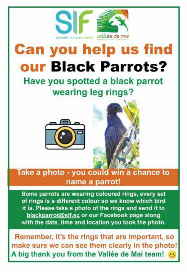
Poster advertising the black parrot campaign \ensuremath{\mathbb{C}} SIF

We are asking people to send photos they have taken of black parrots showing the rings to <u>blackparrot@sif.sc</u>, along with the time and date the photo was taken, as well as the location. Any additional information photographers can provide (for example: it was in a group with three other parrots, eating starfruit) then this would also be helpful. Even if you see the same parrot on different days, we would like to know as all of this information helps to expand our knowledge of the black parrots' habits and build up a picture of their movements, survival and population dynamics.