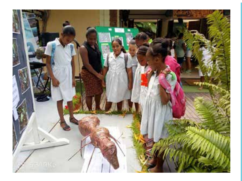
Schoolchildren admiring the exhibition