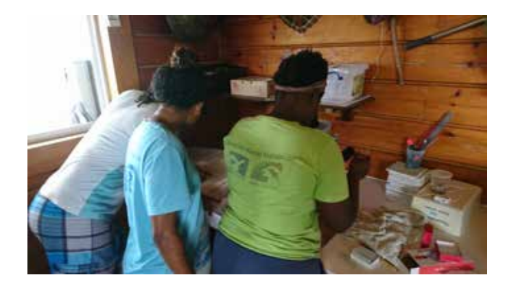
SIF staff working on biosecurity

Invasive ants would be devastating for Aldabra, and control tactics would be a huge challenge if not impossible. Biosecurity measures (procedures put in place to minimize or prevent the introduction of non-native species) have been increased to impressive levels on Aldabra and by SIF staff on Mahé in the last several years. Tourists, staff, and incoming supplies are checked thoroughly before being brought onto land. A recent addition to biosecurity monitoring was to trial an ant monitoring programme on Aldabra in June. This entailed setting containers with protein and sugar baits in specific areas that have high traffic, collecting ants that visit these pots, and cataloguing what species are seen. This will give us an insight into what species are already on Aldabra. Once a system is fully developed, monitoring will be done after supplies and people are brought ashore, to act as an early detection method, in case any invasive ants were able to sneak ashore. Prevention is key, but early detection is the next most important step in ensuring these and other invasive species do not reach and establish on Aldabra. Such monitoring will play an important role in Aldabra's strengthened biosecurity programme - a whole new level of protection.