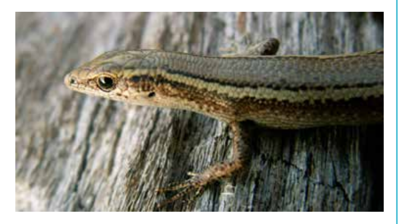
Coastal skink

Similar coastal skinks are found on beach habitats across a significant portion of the tropics, and many island groups, including Australia, Polynesia, and the Western Indian Ocean, in an astonishing range which extends over 10,000 km! These animals have posed a mystery to researchers who are eager to understand long-distance dispersal and how certain groups of animals have evolved and dispersed so widely, across huge bodies of water.