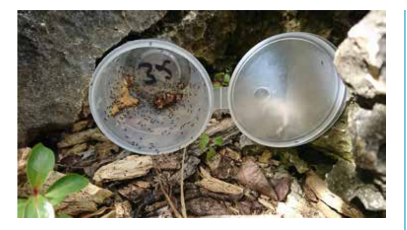
Ants attracted to a protein bait