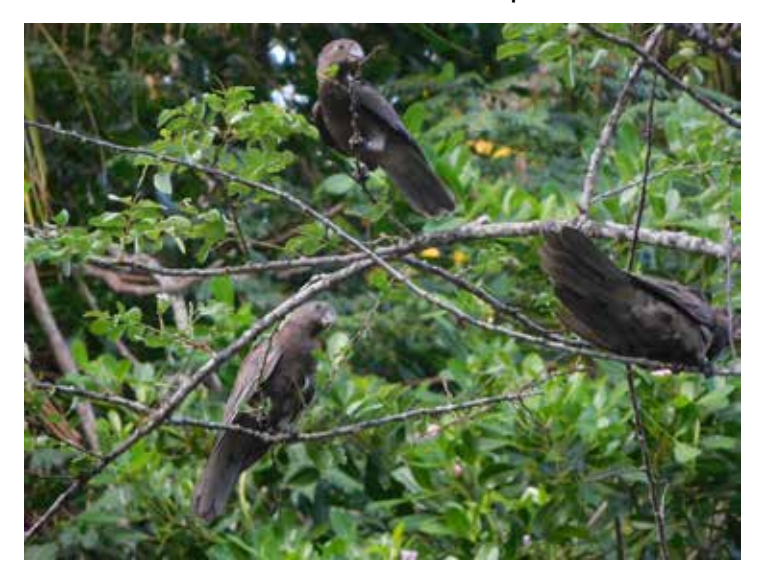
Black parrots tagged with leg rings. You can clearly see the rings of the top parrot - perfect for identifying!

This month we launched a new outreach programme to help us learn more about the black parrots. We have fitted coloured metal rings on the legs of over 250 black parrots in the last 10 years. Each parrot has a unique combination of coloured rings which allows us to identify every ringed parrot if we know the colour of both of the rings. Identifying parrots means we can learn more about their movements and life-span.