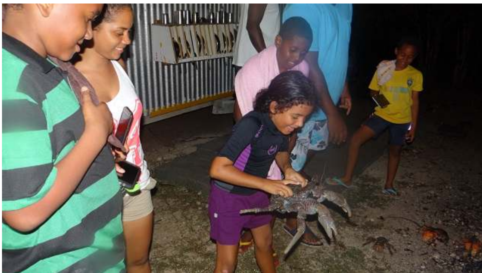
The group got the chance to monitor coconut crabs, locally known as sipay.