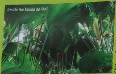
Inside the Vallée de Mai

We receive visitors from all over the world – Russia, Germany, China, France, Kenya, Singapore – young and old. We have also had the pleasure of welcoming some very distinguished guests such as H.R.H Prince Edward of Great Britain, H.R.H Princess Anne of Great Britain, the President of Sri Lanka Mahinda Rajapaksa, the President of Cape Verde Jorge Carlos Fonseca, the former President of France Francois Mitterrand and French international footballer Paul Pogba. I think the important thing to remember is that the Vallée de Mai is a place that everyone can enjoy and appreciate, irrespective of where they come from or their age.