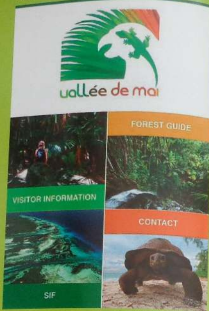
The home page of the app for the Vallée de Mai