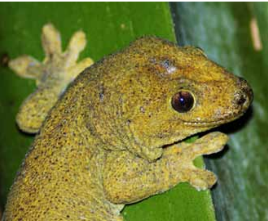
◀ One of the world's rarest reptiles, the Giant Bronze Gecko.