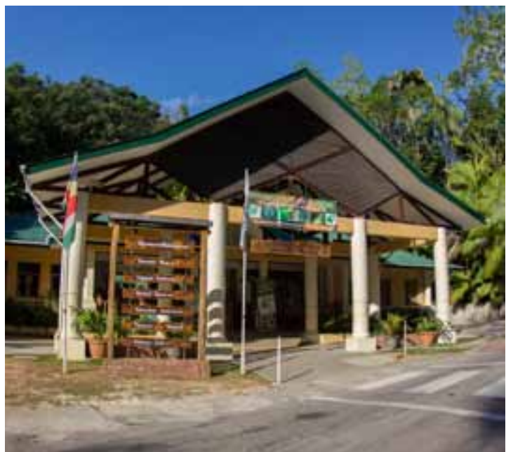
▲ In 2009 the visitor centre was redeveloped, this is how it stands now.

With enhanced visitor services and effective conservation management the Vallée de Mai has become a world class tourist attraction.