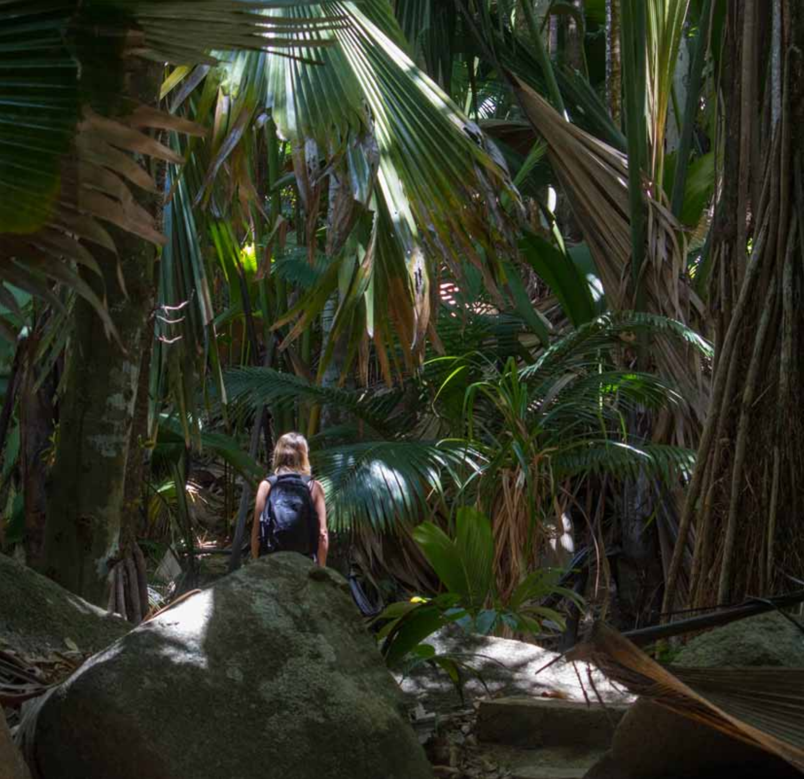
▲ Inside the mysterious and towering forest of the Vallée de Mai, Seychelles.

Seychelles' number one visitor attraction, a visit to the Vallée de Mai is like a step back in time, to a world where dinosaurs roamed the earth. Part of a global network of natural and cultural heritage sites under the umbrella of UNESCO (United Nations Educational Scientific and Cultural Organisation) the majestic Vallée de Mai was recognised as an area that needed protection as early as 1966 when it was declared a nature reserve by the Seychelles government. 2013 was a historic year for the Vallée de Mai when it celebrated its 30th anniversary as a UNESCO World Heritage Site on 9th December.