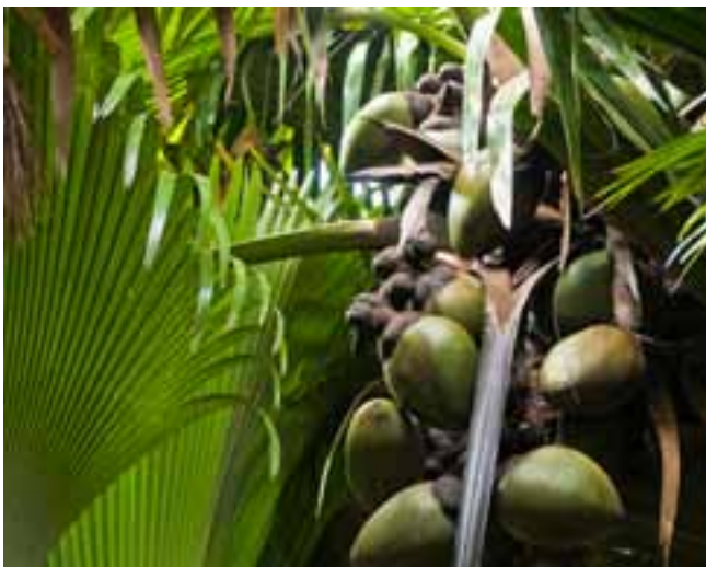
▲ The endemic Coco de Mer, symbol of Seychelles.