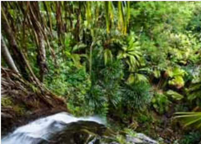
▲ An important source of water for the Praslin community, the Vallée de Mai has a spectacular waterfall.