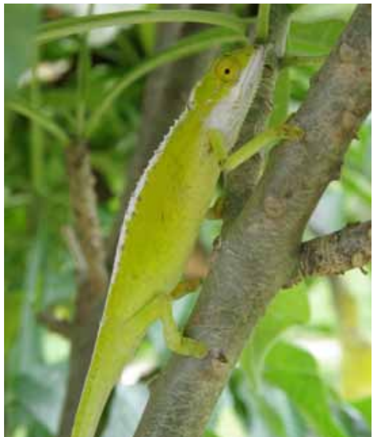
▲ The Seychelles Chameleon, rediscovered after nearly 200 years.

There have been many achievements over the past thirty years but despite this the Vallée de Mai is still in danger. Poaching of the beautiful and valuable Coco de Mer nuts puts the future regeneration of the forest in peril, and endemic plant species fight for space with virulent invasive plants that threaten the native biodiversity of the site. Firm action has been taken against these dangers with an EC funded project tackling the invasive plant