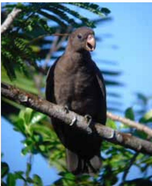
▲ The Seychelles Black Parrot.